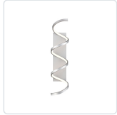
WS93730-AS Antique Silver

A looping radiant line casts light across space in a continuous helical path. The Synergy series is characterized by the rolled rectangular extrusion, which emits soft light through the silicon opal lens. Configured in both linear and ring arrangements, the arcing aluminum allows the curated finishes to be visible at every angle.