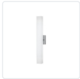
WS8424-BN Brushed Nickel