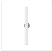
WS8332-BN Brushed Nickel