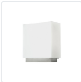
WS3909-BN Brushed Nickel