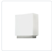
WS3909-BN Brushed Nickel