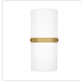
WS3413-BG Brushed Gold