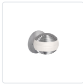
WS10502-BN Brushed Nickel