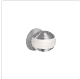
WS10502-BN Brushed Nickel