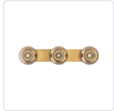
VL57532-BG/CP Brushed Gold/Copper