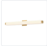
VL47237-BG Brushed Gold