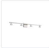
VL19941-BN Brushed Nickel