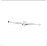
VL18532-BN Brushed Nickel