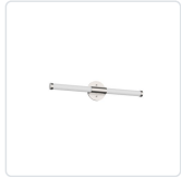
VL18524-BN Brushed Nickel