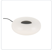
TL12409-BK/OP Black/Opal Glass