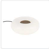
TL12409-VB/OP Black/Opal Glass