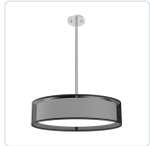
PD7920-BOR Black Organza