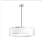
PD7920-WOR White Organza