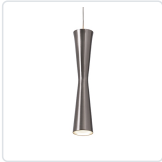
PD42502-BN Brushed Nickel