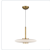
PD37018-VB/GO-3WCCT-UNV Vintage Brass/Glossy Opal Glass