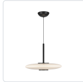
PD37018-BK/GO-3WCCT-UNV Black/Glossy Opal Glass