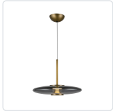
PD37018-VB/SM-3WCCT-UNV Vintage Brass/Smoked