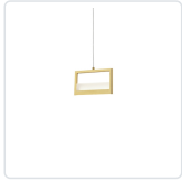
PD31408-BB Brushed Brass