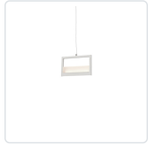
PD31408-BN Brushed Nickel