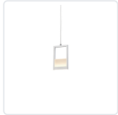
PD31405-BN Brushed Nickel