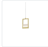
PD31405-BB Brushed Brass