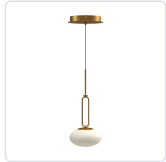
PD29806-BG Brushed Gold