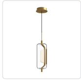
PD28515-BG Brushed Gold