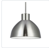
PD1712-BN Brushed Nickel