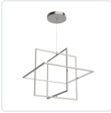
PD16328-BN Brushed Nickel