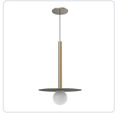
PD15519-BG Brushed Gold