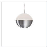
PD10502-BN Brushed Nickel