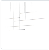
MP18363-BN Brushed Nickel