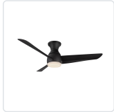
HF91954-MB Matte Black