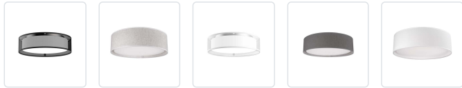
FM7916-BOR-5CCT Black Organza FM7916-BE-5CCT Beige FM7916-WOR-5CCT White Organza FM7916-GY-5CCT Gray FM7916-WH-5CCT White