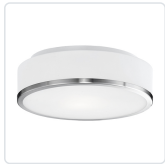
FM6012-BN Brushed Nickel