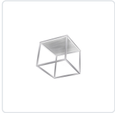
FM34418-BN Brushed Nickel