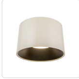
FM16520-PW-3WCCT-UNV Pearl White