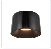
FM16520-JB-3WCCT-UNV Jet Black