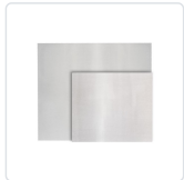
EW6208-BN Brushed Nickel