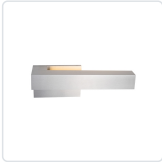
EW13212L-BN Brushed Nickel