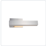
EW13212R-BN Brushed Nickel