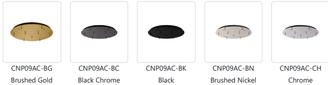
CNP09AC-BG Brushed Gold