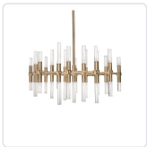
CH9628-VB Vintage Brass