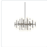
CH96128-PN Polished Nickel