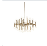
CH96128-VB Vintage Brass