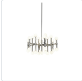
CH96121-PN Polished Nickel