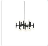
CH96121-BL Black Plating