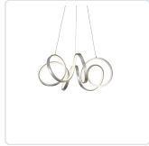
CH93824-AS Antique Silver