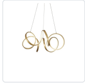
CH93824-AN Antique Brass

A looping radiant line casts light across space in a continuous helical path. The Synergy series is characterized by the rolled rectangular extrusion, which emits soft light through the silicon opal lens. Configured in both linear and ring arrangements, the arcing aluminum allows the curated finishes to be visible at every angle.