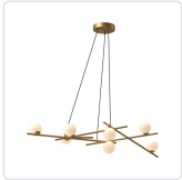
CH89854-BG/GO Brushed Gold/Glossy Opal Glass