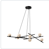
CH89854-BK/GO Black/Glossy Opal Glass