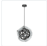
CH51632-BK Black/Light Guide