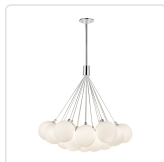
CH3128-OP Opal Glass