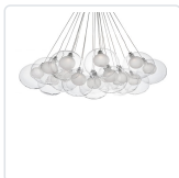
CH3128-CL Clear Glass