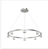
CH19933-BN Brushed Nickel