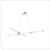
CH18548-BN Brushed Nickel