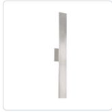
AT7935-BN Brushed Nickel