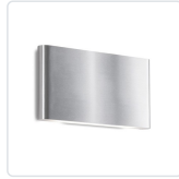
AT68010-BN Brushed Nickel