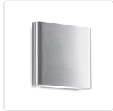
AT68006-BN Brushed Nickel