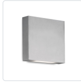
AT67006-BN Brushed Nickel