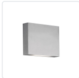
AT6606-BN Brushed Nickel