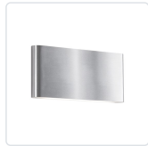
AT6510-BN Brushed Nickel