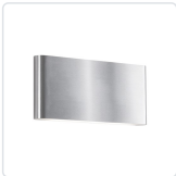
AT6510-BN Brushed Nickel