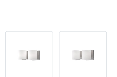
70232BN Brushed Nickel