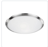
51562BN Brushed Nickel