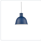
493516-IB Indigo Blue